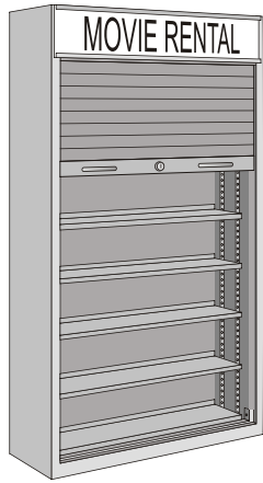
Video Cassette Merchandiser